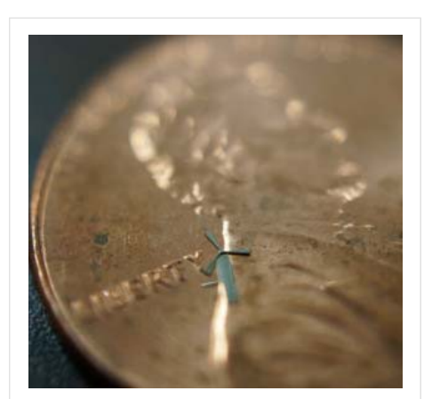
An actual micro-windmill sits atop a penny.

The word "micro" has never been more apropos. To put the size of the micro-windmill into perspective, one single grain of rice is large enough to hold roughly ten of them. This means hundreds of the windmills could be embedded in a sleeve for a cell phone, and wind created by waving the cell phone in the air, or holding it up to an open window on a windy day would generate enough electricity to charge the cell phone's battery.