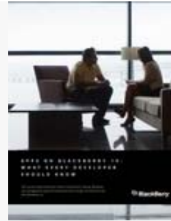
Mobility Apps: What every developer should know