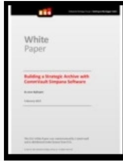
Building a Strategic Archive