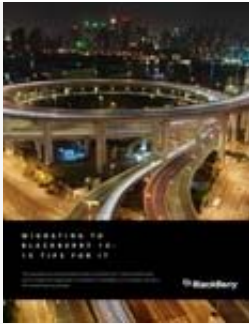
Top 10 tips for Migration