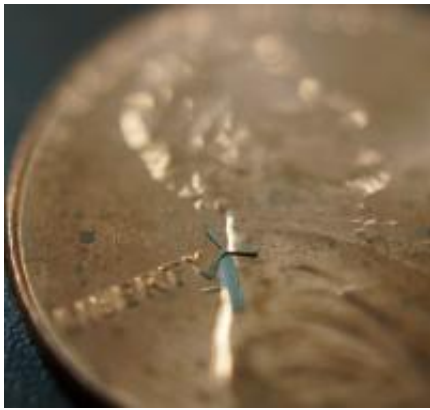
IMAGE: A micro-windmill is pictured on the face of a penny.